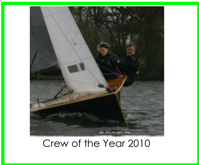
Crew of the Year 2010