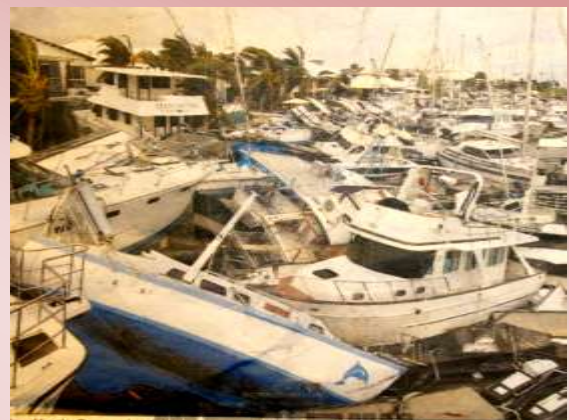
Light winds cause havoc at Xtra!

We may do some theory on roll tacking (and even some practice for the more adventurous!). Everyone welcome but it probably helps to have a Laser of some description!