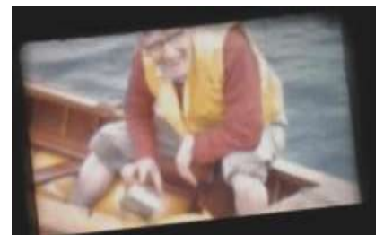
Original bailing from 1961