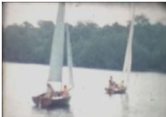
Sailing was blurry back then.....