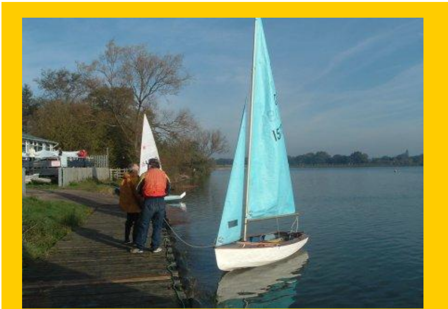
Sailors are rather confused by the return of water to the jetty! This poor man has mistaken his boat for a dog!

All correct entries received by the Editor will be placed in a hat!